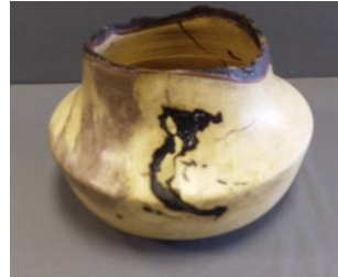
Jeff Brockett – Natural Edge persimmon