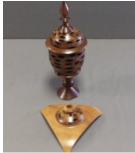
Jim Greenwood – 3 sided cherry & banyan pod