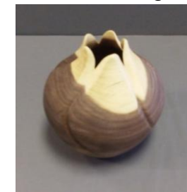
Jim Mason - walnut carved hollow form