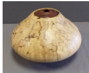
Jeff Brockett – hollow form