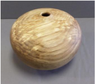
Ray Sandusky – black oak hollow form