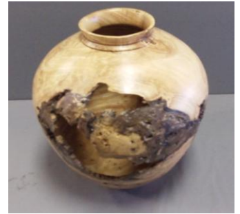
Jim Greenwood – ash hollow form