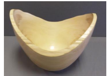
Julia Tate – Norfolk Island Pine vessels