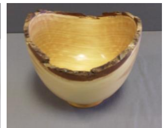
Jim Mason – ginkgo natural edge