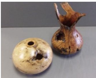
Jim Greenwood – mountain laurel & dogwood hollow form