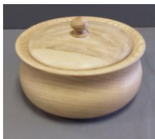
Bob Myers – lidded box