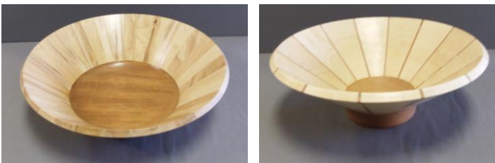
Bob Myers – 2 segmented bowls