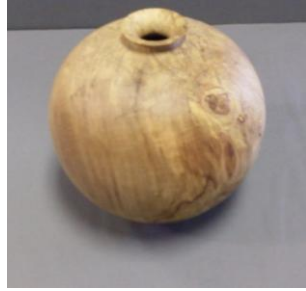
Ray Sandusky – maple hollow form