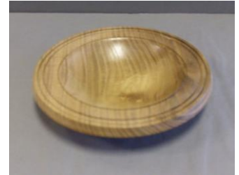
Jeff Brockett – Osage orange platter