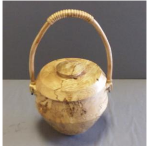
Fred Takacs – Maple Pot Ray Curl – sugar maple bowl