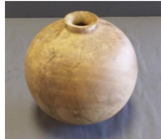
Ray Sandusky – maple hollow form