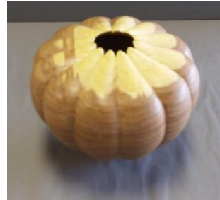
Barry Werner - carved elm hollow form