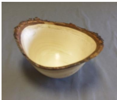
Stephen Campbell – Natural edge maple bowl