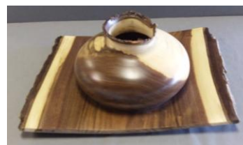
Jim Greenwood – Walnut bowl/square platter