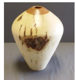
Jim Greenwood – Box elder/cherry hollow form