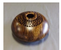
Monte Richards – pierced maple hollow form