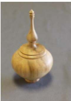
Ron Ferriera - small lidded box