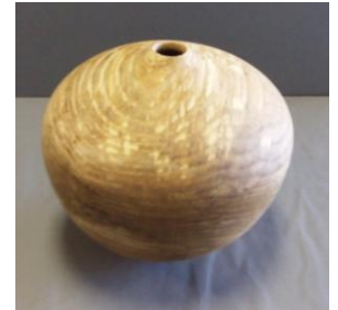
Ray Sandusky – black oak hollow form