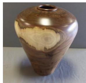
Jim Greenwood – Walnut vase