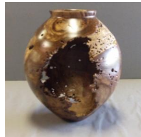
Jim Greenwood – Bay Walnut