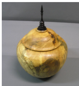
Ray Sandusky - sugar maple vase with walnut finial