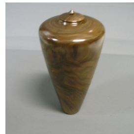
Ron Ferriera - walnut vase