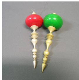
Brevard Haynes - Christmas ornaments