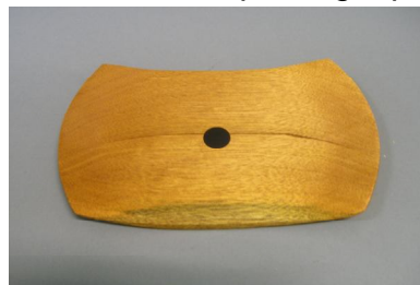
Ben Thompson - mahogany/ebony platter