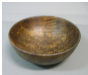
Bill Summar - clare burl walnut bowls