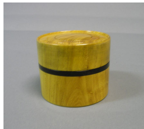
Andy Woodard - small boxes made from holly, cedar, walnut and maple